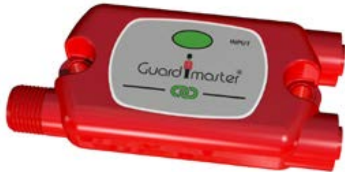
GuardLink Enabled Connection Tap

A truly connected enterprise has real-time control and information available across platforms and devices within the organization. When it comes to linking safety to The Connected Enterprise, our smart safety devices featuring GuardLink technology can deliver information, advanced functionality and flexibility, while enhancing safety and increasing efficiency machine- and plant-wide.